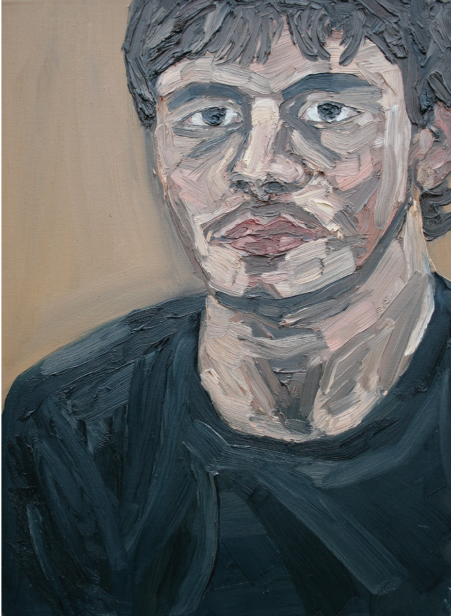
Dave , Oil on canvas, 18 x 24 inches, 2012.