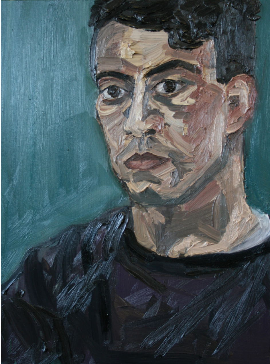
Ashley , Oil on canvas, 18 x 24 inches, 2012.