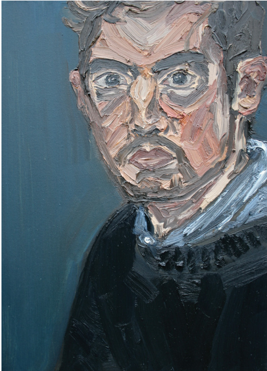
Jack S , Oil on canvas, 18 x 24 inches, 2012.