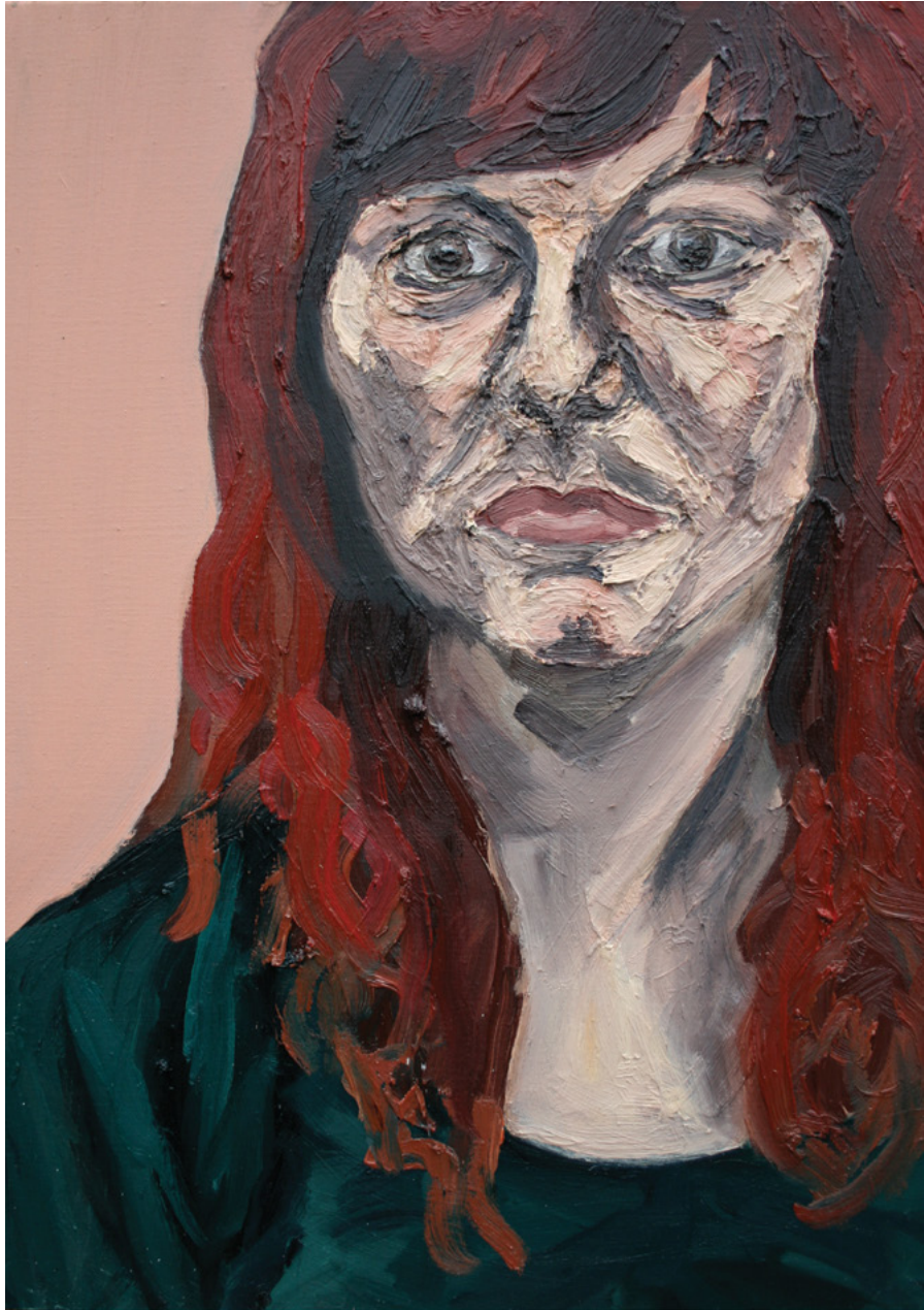
Corinthia , Oil on canvas, 18 x 24 inches, 2012.