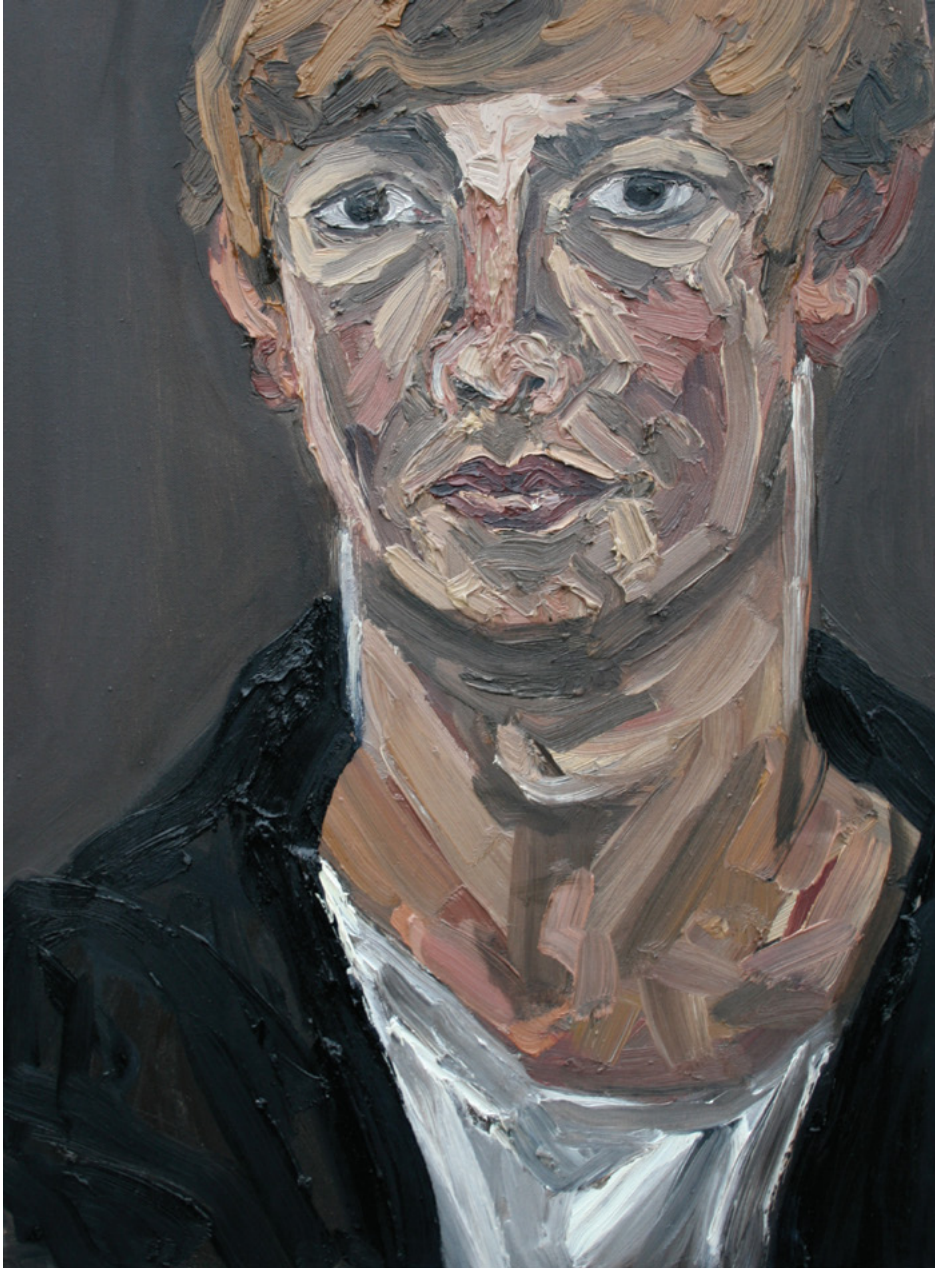
Jack B , Oil on canvas, 18 x 24 inches, 2012.