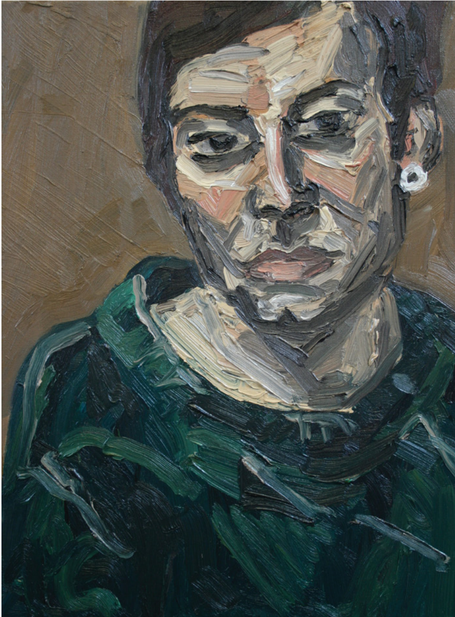
Beth , Oil on canvas (mounted on wood), 18 x 24 inches 2012.