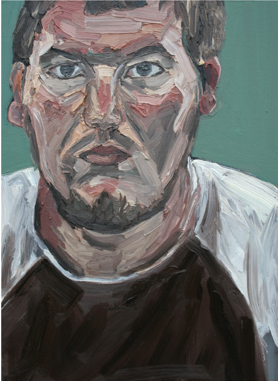
Simon , Oil on canvas, 18 x 24 inches, 2012.