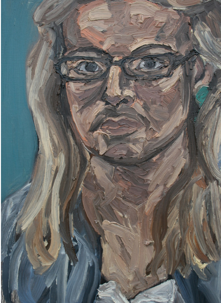
Laura , Oil on canvas, 18 x 24 inches, 2012.