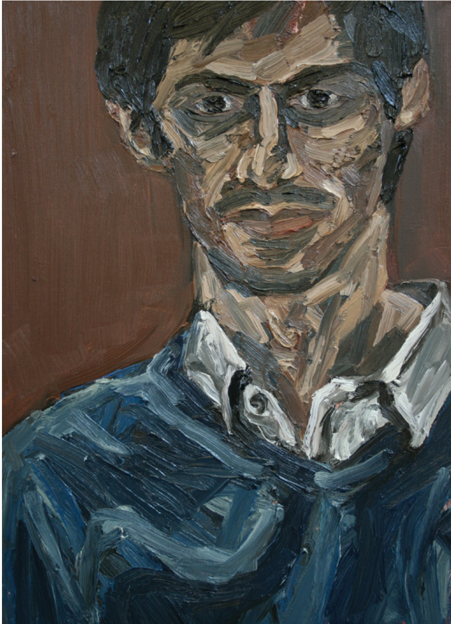
Liam , Oil on canvas, 18 x 24 inches, 2012.