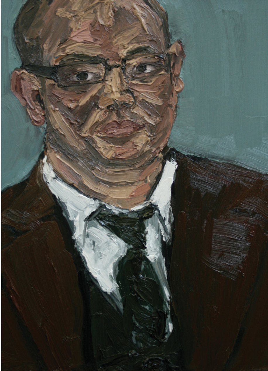
Jonathan , Oil on canvas, 18 x 24 inches, 2012.