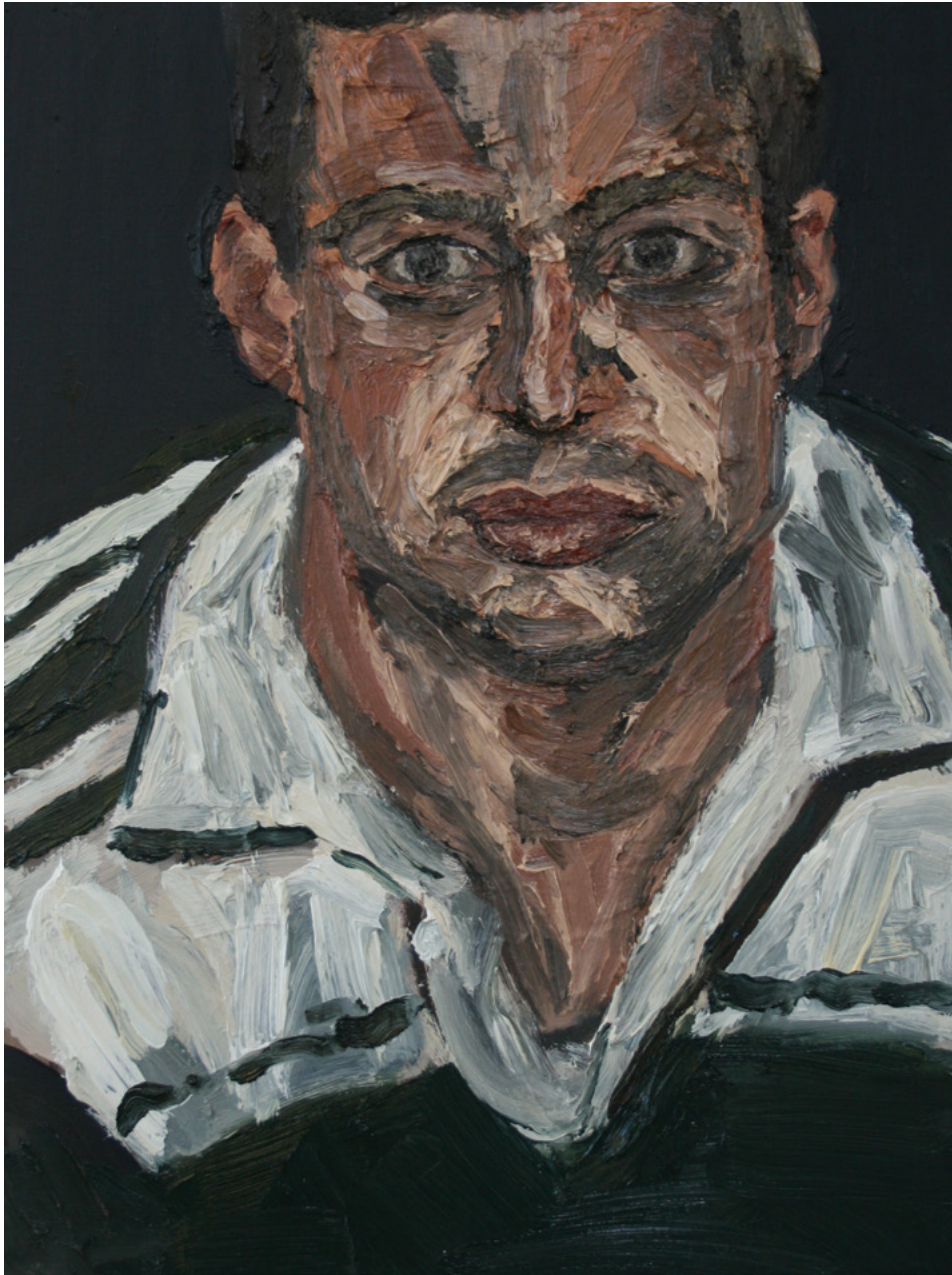
Sam , Oil on canvas, 18 x 24 inches, 2012.